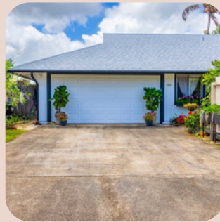
1998 bought for $159,500 2023 sold for $1,150,000