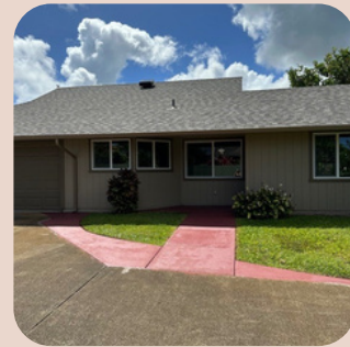
1998 bought for $161,900 2023 sold for $1.25M