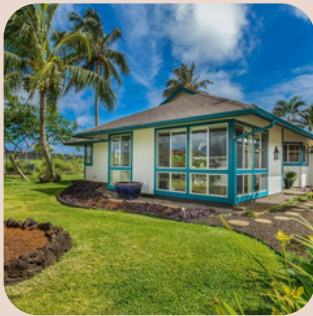
1998 bought for $161,900 2022 sold for $1.05M

A 49-unit single-family fee-simple subdivision built on Titcomb and Kanikele Street in Kilauea town. Completed in 1998, Kilauea Estates was constructed with loan funds from the County of Kaua'i Paku'i Housing Program. The Paku'i Housing Program was established in 1992 with federal emergency disaster funding granted to the county in the aftermath of Hurricane Iniki. The sales prices ranged from $159,500 to $178,000 and were sold to families earning at or below 80% of the AMI for Kaua'i. The homes had a 10-year resale restriction. Now these homes are selling for millions, no longer accessible to local people. The funds that subsidized the homes are lost as well as the benefit to the Kīlauea community.