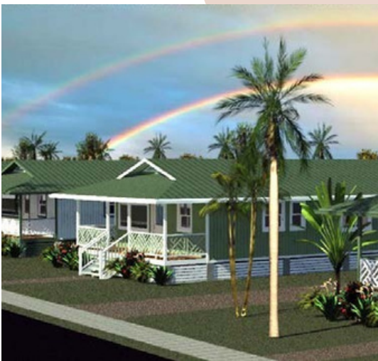
A rendering of the house designs

Located across the street from the Kīlauea Post Office, Kauhale O Namahana will be a community of 11 affordable single-family homes ranging from 2-5 bedrooms with mountain and ocean views. Set in the heart of Kīlauea Town, these homes are walking distance from jobs and services. The value-engineered homes will be built cost-effectively by PAL Construction Company and co-developed with Kauaʻi Habitat For Humanity, who is responsible for building six of the homes. Currently, as a county certified affordable housing project, the homes will be offered to residents on the County Homebuyer List at 80-120% AMI with a 25-year re-sale restriction. After the restriction period ends the home can be sold at full market value, losing all the subsidies acquired to make the home affordable.